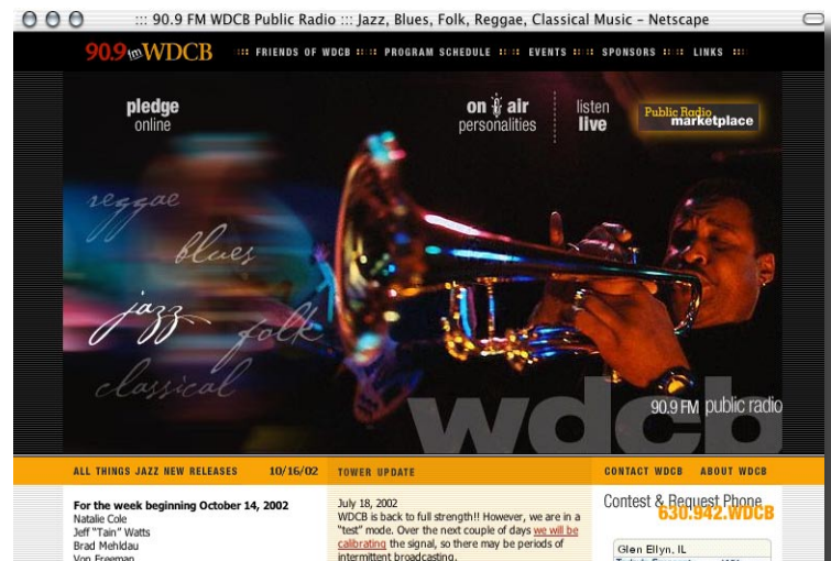
Web Design & Hosting