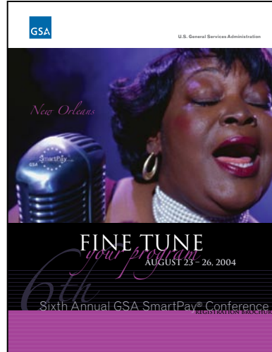
Conference Support Materials

CAGE Code 1WY40 • DUNS 14-834-8253 (630) 293-0071 • E-mail: stan@hamiltonbond.com